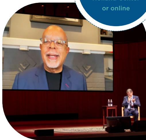
The annual Governor's Lecture in the Humanities featuring Henry Louis Gates, Jr. was a hybrid event, with many viewers tuning in from across Nebraska.

viewers watched in person at the Holland Center or online