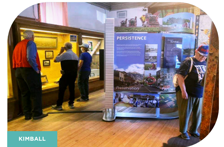
The Smithsonian traveling exhibition, "Crossroads: Change in Rural America," began its 10-month Nebraska tour in September 2021 with visits to local museums in Kimball and Tecumseh.

were logged of Chautauqua videos on YouTube