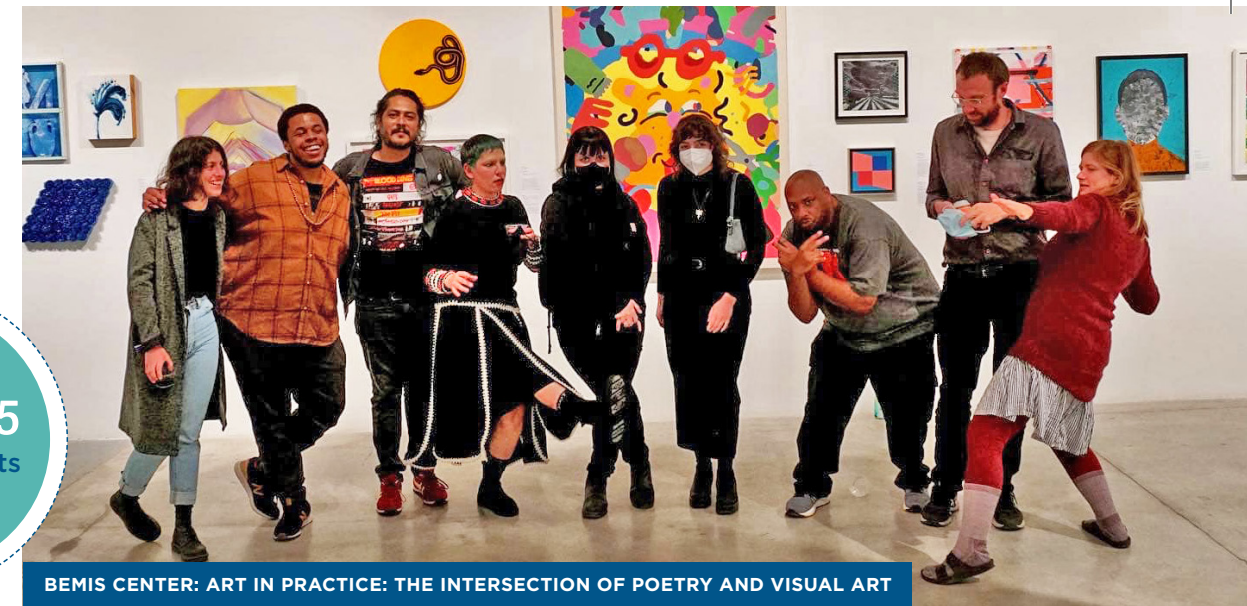
BEMIS CENTER: ART IN PRACTICE: THE INTERSECTION OF POETRY AND VISUAL ART