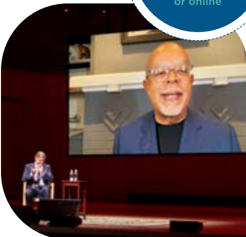
The annual Governor's Lecture in the Humanities featuring Henry Louis Gates, Jr., was a hybrid event, with many viewers tuning in from Nebraska, 10 other states, and the District of Columbia.

viewers watched in person at the Holland Center or online