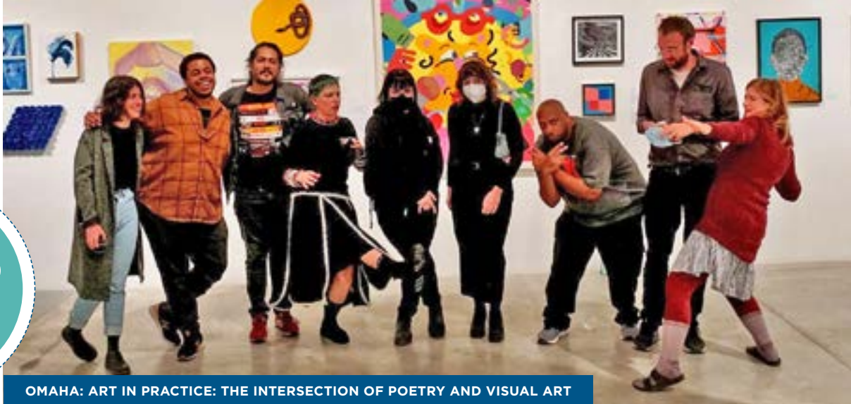
OMAHA: ART IN PRACTICE: THE INTERSECTION OF POETRY AND VISUAL ART